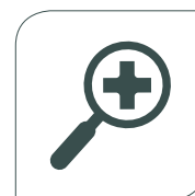
Medical and geophysical imaging